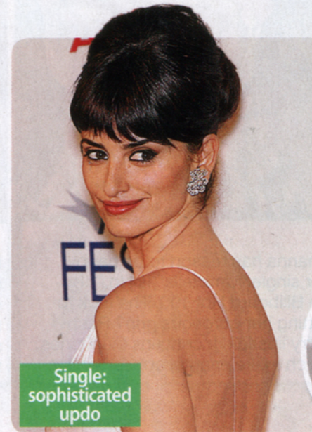
Single: sophisticated updo

When Penélope Cruz began dating Josh Hartnett in March, she traded her severe 'do for a longer bed-head style. "She has come out of her shell